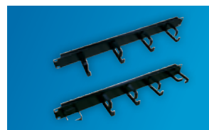
CABLE MANAGEMENT BARS