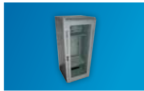
FLOOR STANDING CABINETS

Available sizes: 20, 30 & 40u. Available in widths of 600mm and depths of 600mm, 800mm and 1000mm. Includes roof mount fan tray. 2 x fixed shelves. 2 x cable dump panels. Front door inset glazed. Levelling feet. Heavy duty castors. Available ready to use as standard or flatpack if specified. Custom sizes are available on request, please call us with your requirements.