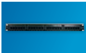
CAT 5E PATCH PANELS