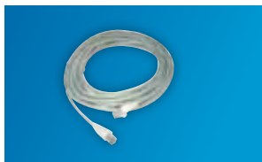
CAT 5E PATCH LEADS

Horizontal 10amp IEC 6 and 12 way format also available. Other options: Surge protection + EMI filter, longer leads, IEC and commando style leads.