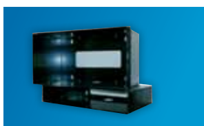
HINGED WALL BRACKETS