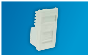
CAT 5E UTP MODULES