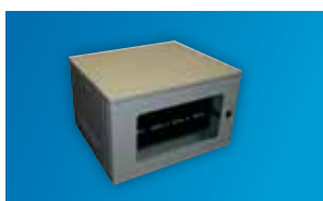
WALL MOUNTED CABINETS

Cat5E leads are also available in Crossover and FTP format. Custom length leads can be made to order, lengths above available ex-stock. Cat 5e UTP leads available in grey, black, blue, green, red or yellow. Please state required colour at time of ordering.